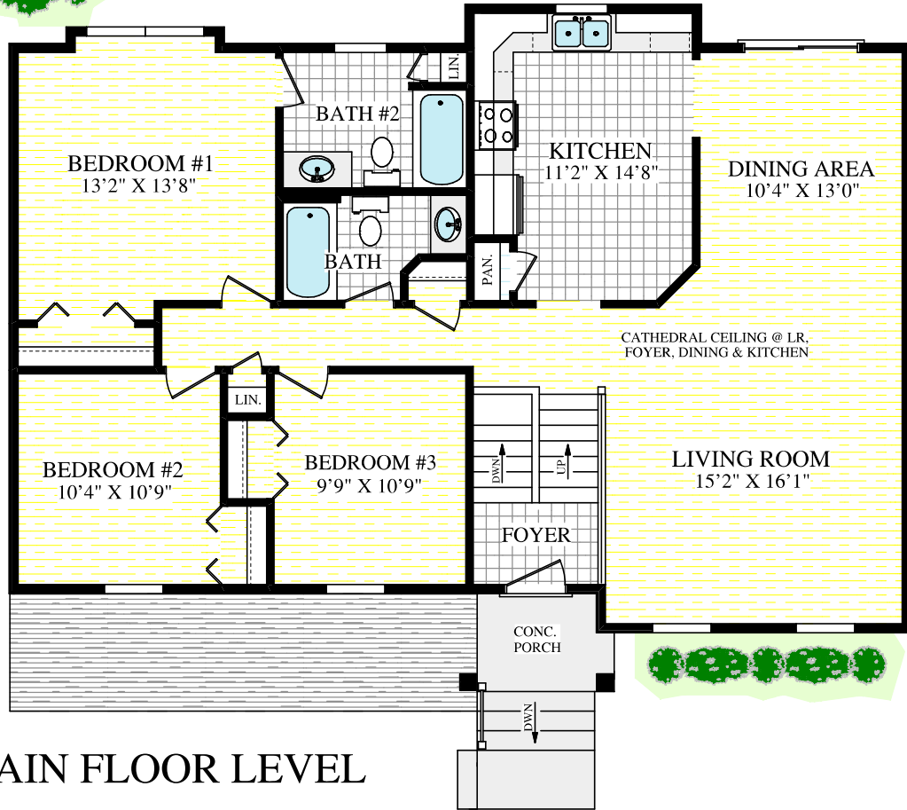
MAIN FLOOR LEVEL